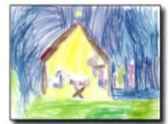
Blaise Murphy-Zaleska, aged 5 Coopersale Hall School