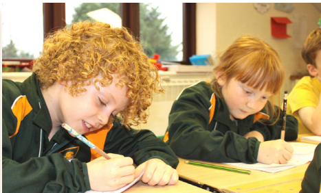
Juniors 10 - 12