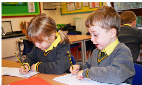
Infants 8 - 9