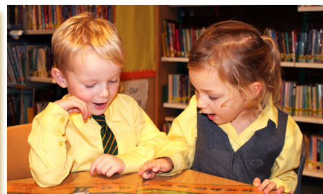
Early Years 6 - 7