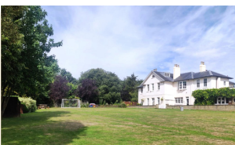
Grounds and Facilities 20 - 21