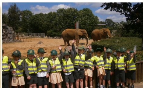
Beyond the Classroom 18