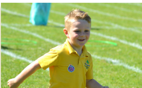
Sports 16 - 17