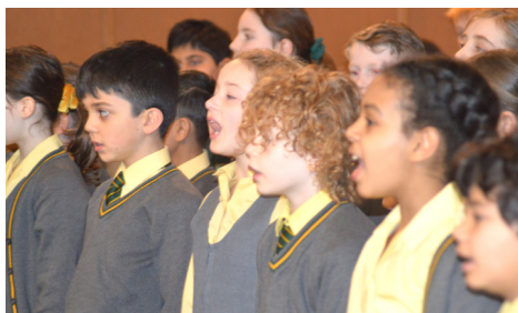
An Excellent School 5