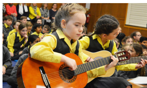
Learn More 24