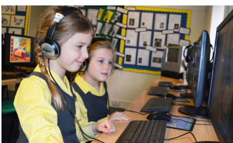
Pastoral Care 19