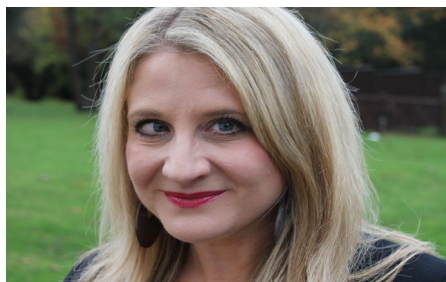
Welcome to Coopersale Hall 4