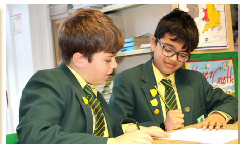
Preparation for Senior School 13