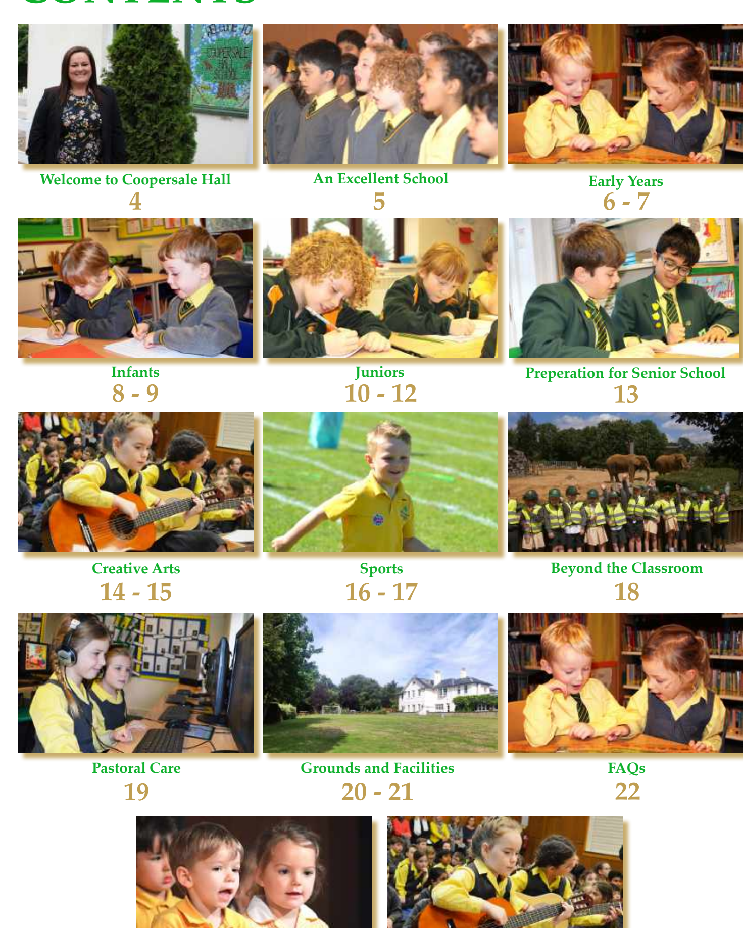
Admissions Learn More 23 24