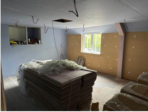
1 st Floor ICT Suite