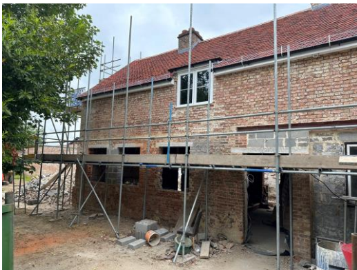
Main entrance with new roof

We will arrange visits for you at the start of the new academic year and will add virtual tours to our website when the building work is complete. In the meantime, the photos below will give you flavour of where we were at the start of the week.