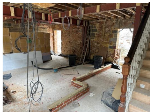
Science Lab with openings to Prep Room and offices