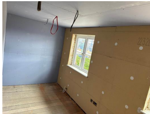
1 st Floor Support Room

There is still plenty of time to go and our contractors are confident that the shiny new building will be ready for the start of the new academic year in September.