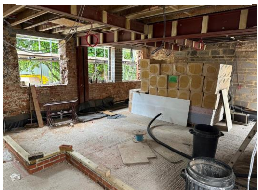
Science Lab with new windows