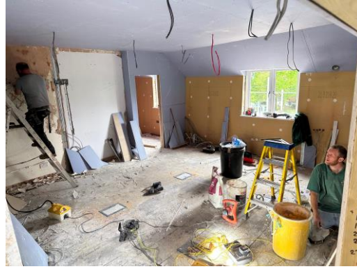
1 st Floor Art/DT Studio