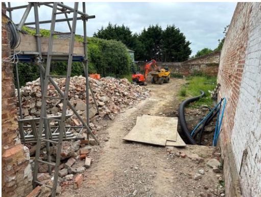
Preparing for the start of Phase 2 - new block facilities